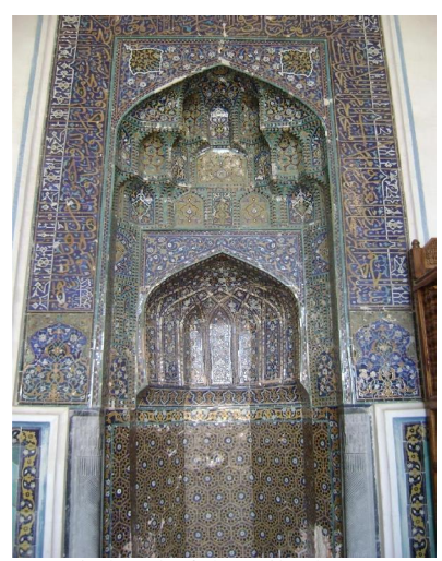
Figure (3) the carver's name on a mosaic band of the mihrab.

inscribed on the mosaic band of the mihrab of the Kalyan mosque, fig. (3). Thus this is the same name. And we can conclude that the mihrab was built in 948H / 1541