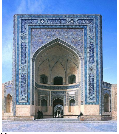
Figure (1) ihe portal of Kalyan Mosque

of construction inscriptions, which contained titles, names of khans and dates of completion. It is remarkable that these Inssscccriptions that include "Royal Decree" executed in the stone, on South side of the main portal- pishtaq- of Kalyan Mosque<sup>(b)</sup>, fig. (1)